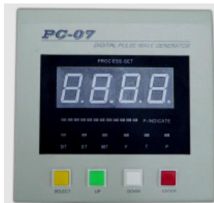
Photo of Digital Pulse Modulator Panel