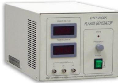
Photo of Modulated Pulse Low-temperature Plasma Experimental Power Supply

Frequency adjustment range: 10Hz ~ 1000Hz. Duty cycle adjustment: 1% to 99%.