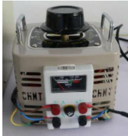
Photo of Voltage Regulator