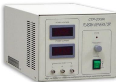
Photo of Modulated Pulse Low-temperature Plasma Experimental Power Supply

Rated input voltage: 220v | Rated capacity: 1kVA | Frequency: 50Hz | Output voltage range: (0-250) V Rated output current: 4A | Number of phases: 1 | Weight: 6.5kg | Insulation heat class: F