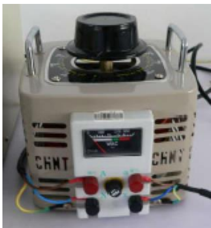
Photo of Voltage Regulator